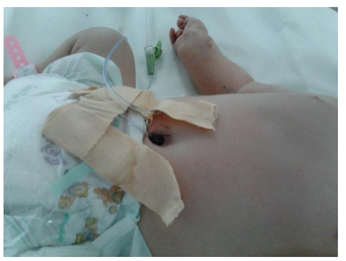
Figure 2.4 stitches and bridge for UVC security

Figure 2.4 shows the bridge and stitches together, the insertion site was visible.