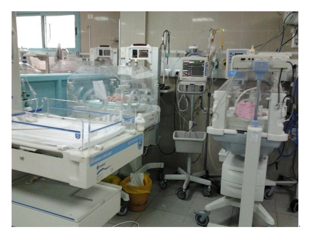
Figure 1.5: This very little space considered one of the risk factors for spread of infection between patients.

The NICU at Rafedi Hospital does not meet the recommendations for adequate spacing that was: the space should be provided for two parents, monitors, ventilators and other equipment. In addition to a space for staff to perform sterile procedures.[12], the recommendations didn't determine the limit space in meters between incubators. See figure 1.5 , which showed the space between the incubators.