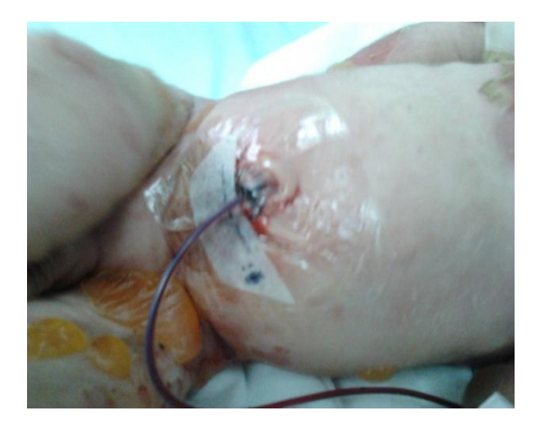
Figure 3.4 dressing after intervention

Table E13 shows the significant change in the staff compliance with daily dressing to the gauze dressing, the non-applicable choice mean that the dressing was transparent which can be keep for seven days. The transparent dressing was available in the pharmacy for other types of CV lines, it is provided to the adult ICU. Now it used for umbilical catheter as routine, the head nurse through the HIS (health information system) requested it daily through item ordering page. During the post intervention period, out of 84 children, there were 18 (21.4%) cases had redness around the umbilical area, 4 of them had both redness and swelling, 2 children had redness, swelling and exudates. Figure3.4 shows the transparent dressing after intervention.