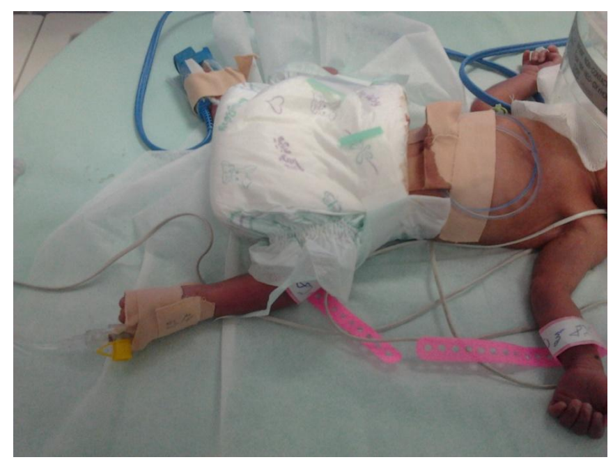
Figure 1.4 umbilical catheter dressing

I observed that all umbilical catheters dressing was done by applying gauze then a bridge done with adhesive plaster, other layer of adhesive plaster applied over the bridge. As in the below figure 1.4.