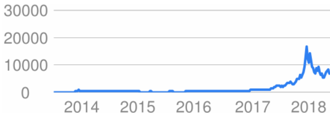
Figure 1. Bitcoin Price in EUR

As the name suggests, cryptocurrencies are built on cryptography and blockchain technology. Cryptocurrencies are difficult to counterfeit because of this encryption feature and the fact that blockchains are relying on consensus. Most famous are Bitcoin and Ether. Their values fluctuate heavily, see Figure 1.