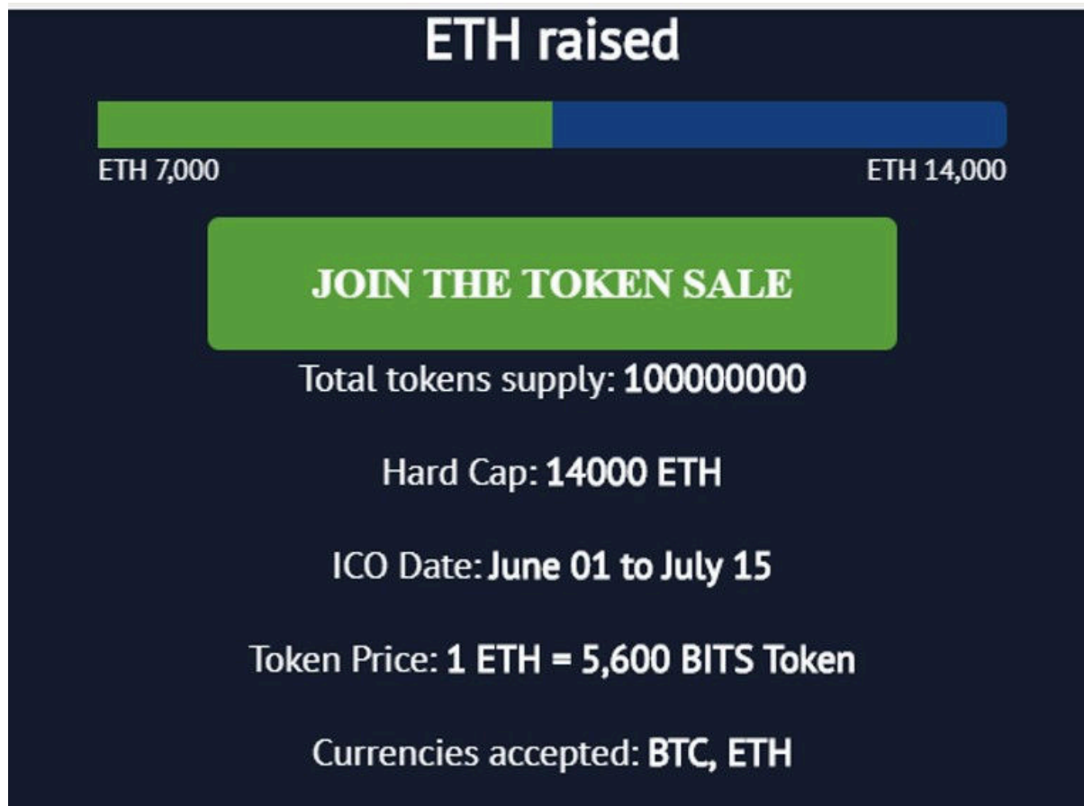
Figure 4. ICO Token Sale example

An ICO owner has to keep the investors well informed about the fundraising status, see Figure 4. Investors can usually enjoy a pre-sale discount in the region of 20%. In above case an investor will receive 5,600 BITS Token (BitStump will become an exchange offering trading between popular currencies like the US$ and cryptocurrencies) for one ETH. In this case one BITS coin would cost around 0.1 US$. Most common is an ICO offering of one coin equaling one US$.