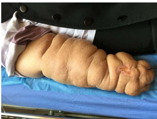
Figure 1. One of the breast surgery survivors without post-surgical rehabilitation (Patient consent was attained to use for scientific use)

The age ranged between 32-78 years old (M=54, SD=11). The Weight between 51-94 kilograms (M=70, SD=20). The height ranged between 154-170 cm (M=163, SD=4) Body Mass Index (M=29.4, SD=6.6). 90% were married and 10% are either single or widows. No single participant of our sample had any type post-surgical rehabilitation services, Main types of surgeries were Radical mastectomy was (30%), Axillary Lymph Node Dissection (10%), Radical mastectomy and axillary lymph node dissection (55%), and Lumpectomy (5%). The most common complications post-surgical intervention for breast cancer were Frozen shoulder 30%, Lymphedema 25% (Figure 1), Post Mastectomy Pain Syndrome 20%, Axillary Web Syndrome 15%.