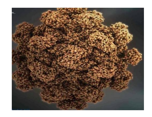
Figure 1: Hepatitis E Virus structure (Aggarwal et al., 2011).

Hepatitis E is a viral hepatitis caused by the Hepatitis E virus (HEV), also known as enterically transmitted, non-A, non-B virus (Trinta et al. , 2001 and Aggrawal et al. , 2000). HEV is a member of the Genus Hepevirus and the Family Hepeviridae. As shown in figure 1 it is a positive-sense, single-stranded, non-enveloped RNA of approximately 7.5 kilobase (kb) (Verghese et al. , and Yoon et al. , 2014).