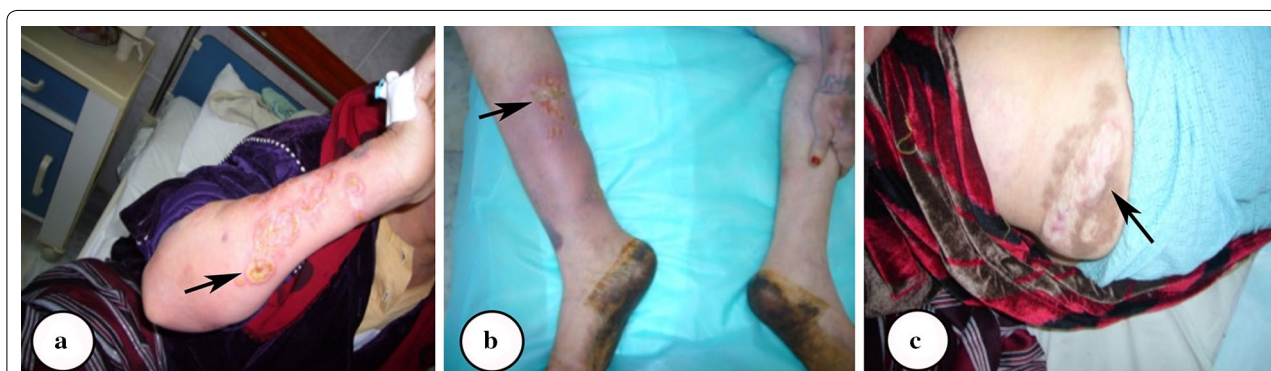
Fig. 1 Deep ulcers on different regions of the patient extremities. a Multiple well defined erythematous ulcers with raised irregular indurated margins on one of the forearms. b Ulcers on flexural surfaces of the right leg associated with swollen inflamed surrounding skin. c A large hypo pigmented atrophic scar surrounded by a rim of hyperpigmentation over right buttock (healed CL lesions)

Cutaneous leishmaniasis has been endemic in North-western regions of Libya for a long time. The incidence of this infection is rising since the year of 1971, and new foci have been reported recently [5]. Clinically, CL can