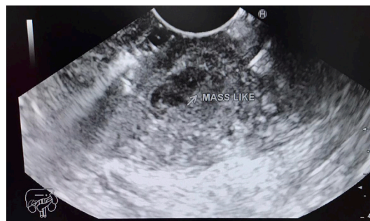
Fig. 3b. shows Mass-like lesion found on Endoscopic Ultrasound.

aspiration was performed and revealed purulent material “pus”. At that point we confirmed the diagnosis of abscess and then a needle knife was used to drain the abscess into the gastric cavity (Fig. 3c).