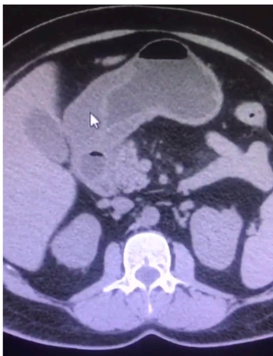
Fig. 2. Abdominal CT scan without contrast showing wall thickening involving the pyloric canal and first part of duodenum (arrow).