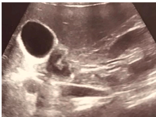
Fig. 1. Abdominal Ultrasound showing Focal area of Wall thickening involving the first part of the duodenum.