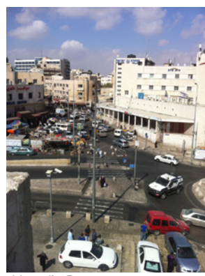
Herod's Gate area

In accordance with this conception, Israeli governments have taken measures in recent years to strengthen the spatial and functional ties between Ma'ale Adumim and Jerusalem. The planning authorities have approved an outline plan for residential neighborhoods in E1, an area that lies within Ma'ale Adumim's city limits and borders Jerusalem's jurisdictional boundary. ... [D]espite ... American opposition to construction in E1, Israel moved the Samaria and Judea Police District headquarters there. While constructing the police headquarters, Israel paved roads and built infrastructure to serve hundreds of housing units planned to be erected nearby.<sup>2</sup>