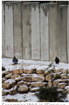
eparation Wall in <sup>c</sup>Eizariyya

With only 13% of land zoned for Palestinian development, when Palestinians comprise 34% of the Jerusalem population, land plots have become very expensive. Seeking a building permit is a complicated, tiresome, and highly