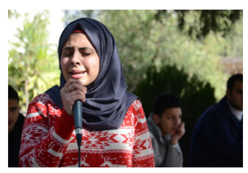
Morning Art Garden in Abu Dis

Jerusalem can indeed be found in the hearts of many people around the world. Whenever I tell artists or partners from other music or academic organizations about our promising students, our concert projects, and our latest artistic developments, I am overwhelmed by the enormous interest, curiosity, and will to support. This international commitment has led to spec-