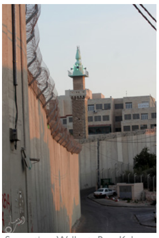
Separation Wall at Ras Kubsa lunction

A recent letter to the editor of The New York Times makes a bitter complaint about the U.S. Supreme Court's recent decision regarding the location of Jerusalem ( Zivotofsky vs. Kerry ), which held that Congress may not require the State Department to indicate in passports that Jerusalem is part of Israel. "Jerusalem," the letter writer posits, "is where the Knesset is, and where Israel's prime minister, cabi-