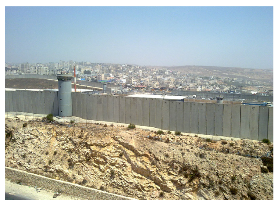
Separation Wall around a refugee camp

tially a city of justice, while in parallel re-adapting ourselves to such a new spatiality. As Harvey notes, "[t]he freedom to make and remake ourselves and our cities is ... one of the most precious yet most neglected of our human rights."