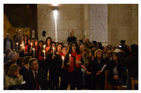
Christmas Concert at St. Anne Church