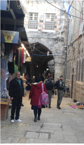
Alwad Ally-Old City of Jerusalem

of this sort from random tourists, who were surprised to enter an old Jerusalemite house for the first time in their lives, and then be treated to tea, coffee, or even a delicious lunch or dinner, depending on the length of their stay. We once hosted an American family who arrived unexpectedly; there was nothing significant to offer them, so my father washed some cucumbers, which was the only meaningful thing we could present them after they declined tea and coffee.