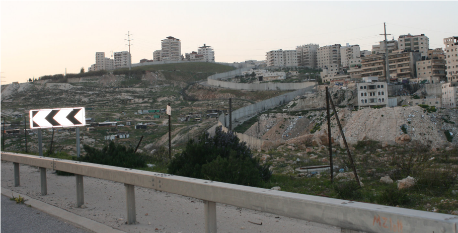
Shufat Refugee Camp

a clear example of how architectural elements are used to control the daily lives of the Palestinians and to influence the dynamics of demography in the city. According to OCHA (United Nations Office for the Coordination of Humanitarian Affairs), about 100,000 Palestinian Jerusalemites are separated by the wall in Shu o fat Refugee Camp and Kufur o Aqab alone. In some areas the wall is just a fence, which is neither watched nor protected. How, then, can it provide protection? Palestinians and Israeli settlers who want to access Jerusalem from the West Bank must go through checkpoints by vehicles. Whereas soldiers at the checkpoints used only by Palestinians (like Qalandia checkpoint) stop and check every vehicle, soldiers at other checkpoints, where also settlers pass, may allow the passage of some cars without stopping or checking them, potentially allowing the passage of people and materials that might threaten “Israeli security”. So in fact, the wall is indeed not a protection wall; it is a racial colonial separation wall. In Jerusalem alone, it leaves 25 surrounding villages and neighbourhoods completely isolated; these separated areas, which are part of Jerusalem and under its administration, lack proper services and infrastructure. At the same time, the Separation Wall encircles the Holy City and the ring of Israeli settlements around it, thereby increasing Jerusalem’s isolation from the West Bank.