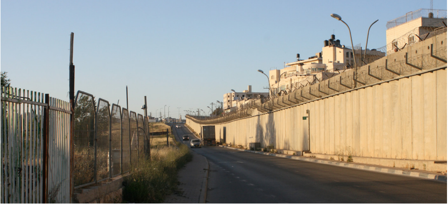
Separation wall approaching Qalandia check point

Since the occupation of the West-Bank and the annexation of “East Jerusalem” 50 years ago, Israel has been using architecture and planning as a tool against the development of Palestinian-populated neighbourhoods in Jerusalem. Neglect and lack of services have left an impact on Palestinian communities to a degree that has made it unbearable to live in many of these neighbourhoods. Palestinian residents of Jerusalem receive few of the services for which they ostensibly pay taxes; in many areas, roads are poorly paved, sidewalks hardly exist, and solid waste is stacked. 1 Yet, Palestinians are obliged to pay their taxes regularly in order to prove their residence in Jerusalem - as part of the imposed “centre of life” policy- or risk losing their legal status in the city. 2