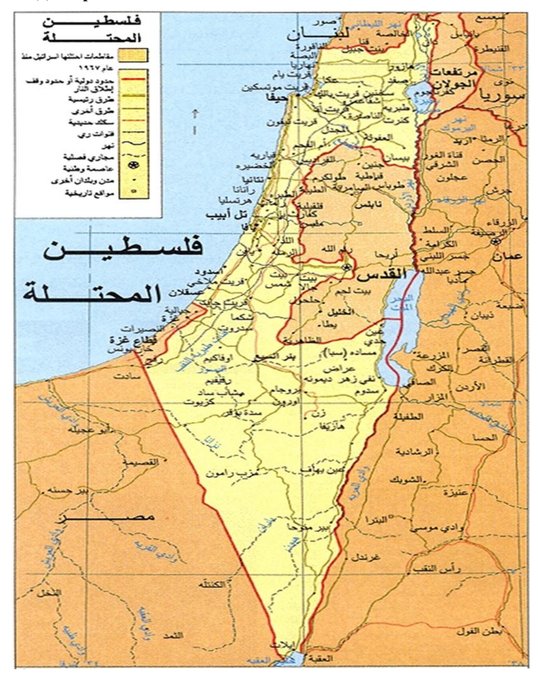
Annex (6): Map of Palestine