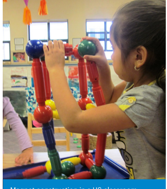
Magnet construction in a US classroom.

Last, we recommend the inclusion of teacher educators