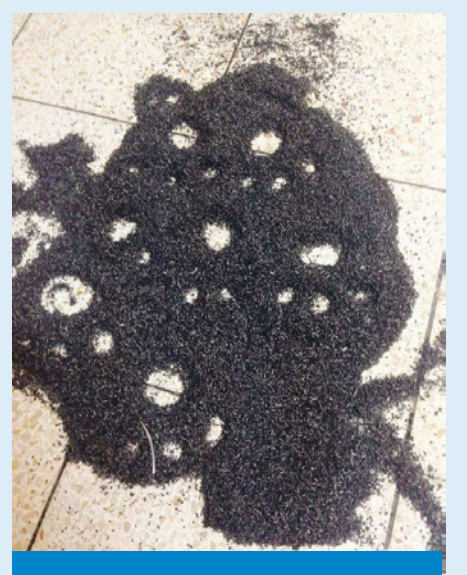
Iron filings for experimentation in Razan's classroom.

the magnets, and they discussed their discoveries with each other as they arose.