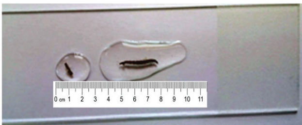
Figure 1. The fourth stage Psychoda albipennis larvae on glass slide

The patient was discharged and recommended to drink plenty of water and prescribed a urinary tract antiseptic to interfere with any secondary bacterial infection. A month later, the patient was followed up and large number of grayish worms were reported dead and discharged in the urine, clinically, abdominal pain and discomfort were disappeared.