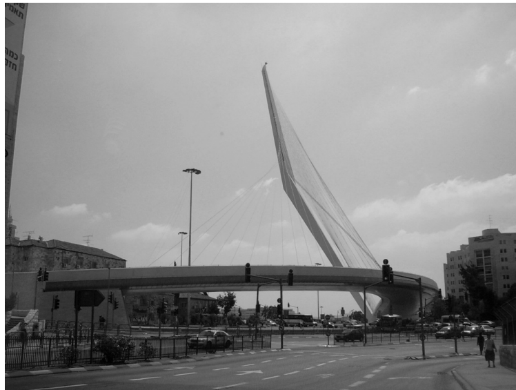
Figure 3. Calatrava's Bridge of Strings, Jerusalem.

Palestinians know Calatrava's bridge in Jerusalem as the White Bridge or 'Al Jiser Al Mualaq' that translates as the Hanging Bridge and Israelis refer to it as the Bridge of Strings or David's Harp due to the cable strings that help suspension of the bridge (Figure 3). When somebody looks at the city from a distance, this bridge appears as one of the most dominant structures, together with the Dome of the Rock, and the new separation wall on the skyline of the city.