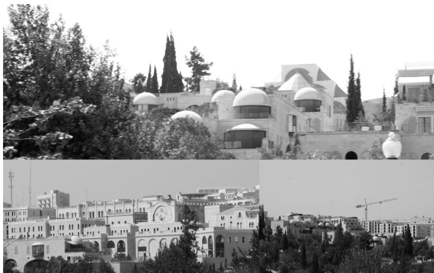
Figure 2. Mosche Safdie's David Village, Jerusalem.

Safdie's David Village (Figure 2), which was designed in 1986 and completed in 1993, is situated beside the Old City of Jerusalem to the west. Today, it is surrounded by very old buildings and other, newer buildings. David Village is part of a larger complex, which is a project of an urban renewal around the Old City. It stretches to the commercial center of the city in the west, partially built on an old Muslim cemetery called 'Ma'aman Allah', commonly known as 'Mammila'.