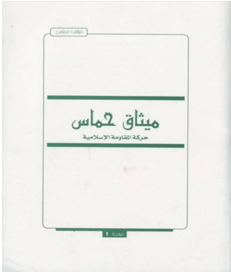
Figure 4.1: Cover page of Hamas Charter

While Israeli’s translation does not show any particular cover or layout, ITIC adds a cover page to its translation, Hamas Charter (1988) . This cover page is set within a double-lined blue frame, including the date on which the translation was published, the logo and name of the translating institution, and the title and sub-title of the translation. Using a colour scheme of green, black and purple, the cover page also features a photograph of Sheikh Ahmad Yassin (see Figure 4.2 below). On the top right corner of the photograph lies Hamas’ logo. The title ‘ميثاق حركة المقاومة الإسلامية – حماس’ (Mīthāq Ḥarakat al-Muwqāwamah al-Islāmiyyah – Ḥamās, lit. ‘The Charter of the Islamic Resistance Movement (Hamas)’) is printed on the foreground of the picture. The place and occasion on which the charter was published are then provided: “The Governorate of Qalqiliya – The Seventeenth Anniversary of the Glorious Founding”. The picture is captioned in bold black font: “The front cover of Hamas Charter, printed in Qalqilya in