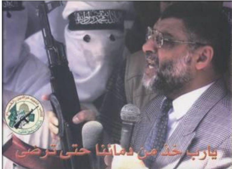
Figure 4.4: Picture of Abdul Aziz al-Rantisi

The logos of Hamas and its military wing, the Izz al-Din al-Qassam Brigades appear on the pictures of Sheikh Ahmad Yassin and Abdul Aziz al-Rantisi, which ITIC cites in its translation of Hamas Charter. The selection of these visual representations informs the target readers of Hamas’ political and ideological position and view. ITIC (2006: 2) states that Hamas Charter “calls for the destruction of the State of Israel”. These logos conjure up this particular effect and instil fear within the target audience.