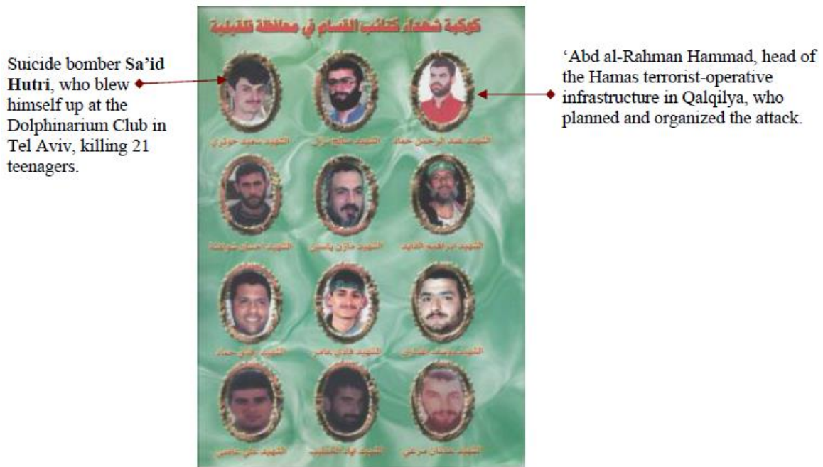
Figure 4.3: Picture of members of Hamas’ Izz al-Din al-Qassam Brigades

ITIC also includes a picture of Abdul Aziz al-Rantisi (ITIC 2006: 8) (see Figure 4.4 below), the official leader of Hamas after Sheikh Ahmad Yassin had been killed in March 2004 (Hroub 2006: 127). Al-Rantisi was “uncompromising on the political stance of Hamas as enshrined in its charter” (Alshaer 2008: 115). He often called for destroying Israel and establishing an Islamic state in Palestine “‘from the sea to the river’ (from the Mediterranean to the River Jordan)” (Chehab 2007: 112). Israel assassinated Al-Rantisi on 17 April 2004 (Faure 2005: 154).